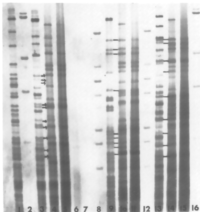
FIG. 1 MZ 1.3 DIGOXIGENIN : Lane 1 - genomic DNA control; Lane 2,16 - bacteriophage DNA HIND III; Lane 3,9,13 - Child; Lane 4,10,14 - P.f. heart blood; Lane 5,11,15 - P.f. muscle tissue; Lane 6 - P.f. bone marrow, degraded; Lane 7 - P.f. brain cortex, degraded; Lane 8,12 - bacteriophage Bst EII

Only the use of single locus probes [pYNH 24 (PROMEGA), pL 336, (COLLABORATED RESEARCH INCORPORATED)] led to reproducible and definite results. These results are shown in figure 2 and described in table 2. The dead putative father could unambiguously excluded from paternity.