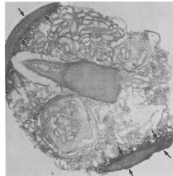
Fig. 2. IEM of dried germ cells with GDA-J/F3 MoAb. The reaction (electron dense deposits) is seen on the fibrous sheath just beneath the cytoplasmic membrane of a spermatid (arrows).